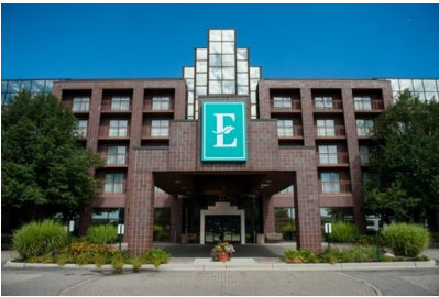
Embassy Suites Livonia