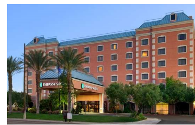
Embassy Suites—Las Vegas