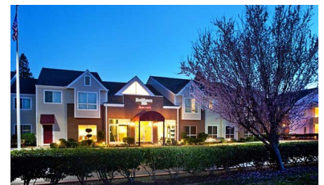
Residence Inn Natomas