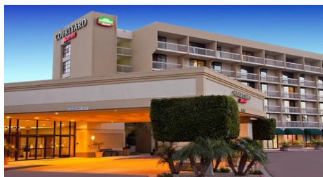
Courtyard Oxnard Ventura