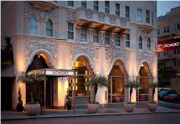
Renaissance Historic District- Charleston