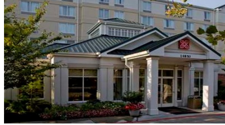
Hilton Garden Inn Lake Oswego