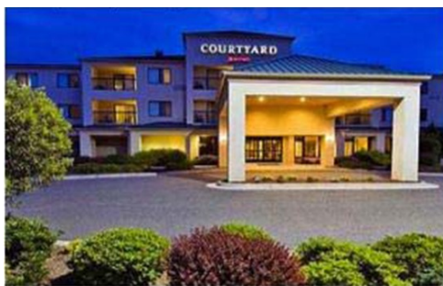
Lynchburg Courtyard Hotel