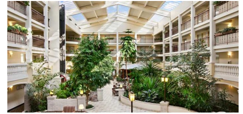
Embassy Suites Colorado Springs