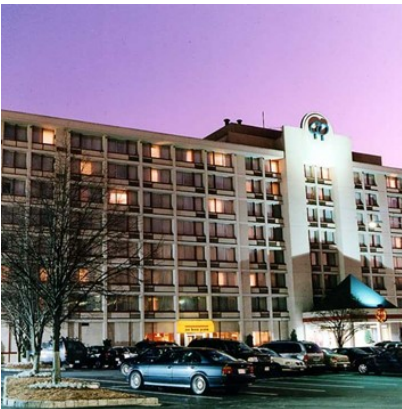
Norwalk Doubletree Club