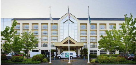
Embassy Suites Bellevue