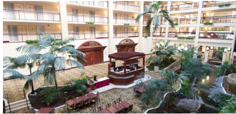
Embassy Suites Blue Ash