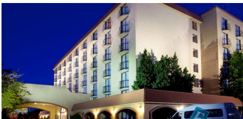
Embassy Suites Denver