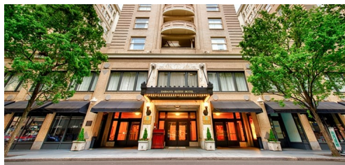
Embassy Suites Portland