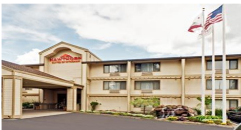
Sacramento Hawthorne Suites