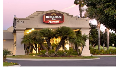
Residence Inn Oxnard River Ridge