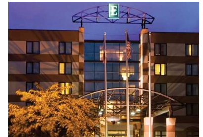
Embassy Suites Lynnwood