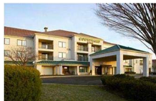
Princeton Courtyard Hotel