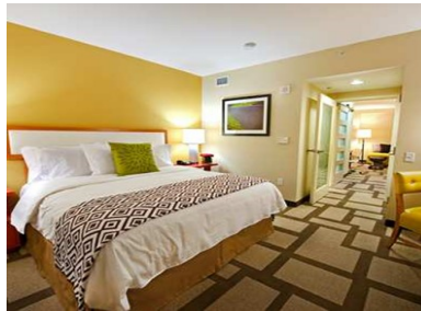
Embassy Suites Houston