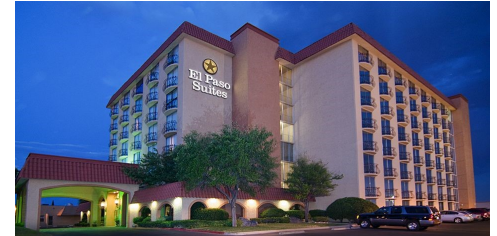
Embassy Suites El Paso